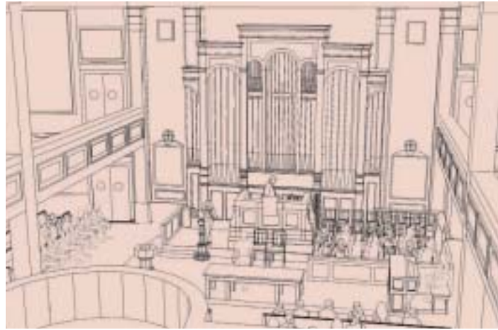
Drawing of proposed renovated sanctuary with organ as seen from the balcony

Our deteriorating organ gives us a unique opportunity to adjust the elements of worship to more fully connect us with one another, and with God. Moving the organ and the choir to the chancel will enhance the sound of both, and improve the choir’s connection with the rest of the congregation. Other changes to the chancel will help