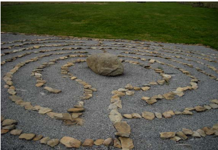
The labyrinth at Meadowkirk